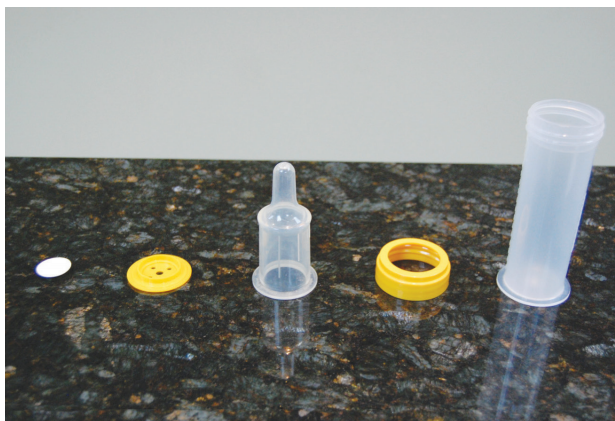
The Haberman Special Needs Bottle Made by Medela

There are three rates of milk flow, each represented by a line on the barrel of the nipple. The shortest line means no or slow flow, the medium line means medium flow, and the longest line means regular or high flow. The desired flow line should be upward, under the infant's nose.