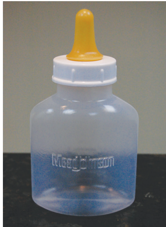
The Enfamil Cleft Palate Nurser by Mead Johnson

When you feed your baby with this bottle, you gently squeeze, in a pulsing manner. If you squeeze too hard or with a constant pressure, your baby may take in too much milk, or be forced to swallow milk when she's resting and not ready to swallow. This could cause her to cough and sputter. So remember, squeeze in a pulsing rhythm - when the baby sucks, you squeeze. When she rests, you stop squeezing. You don't need to take the nipple out of the mouth when the baby's resting - just leave it there and she'll start feeding again in a few seconds.