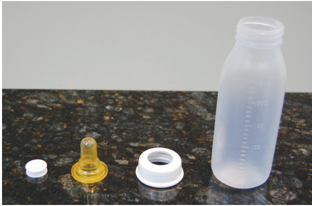
The Pigeon Bottle Made by Respirationics